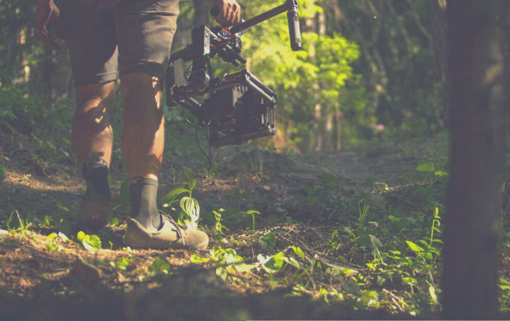
SRAM French Lessons video shooting with Mind Spark Cinema