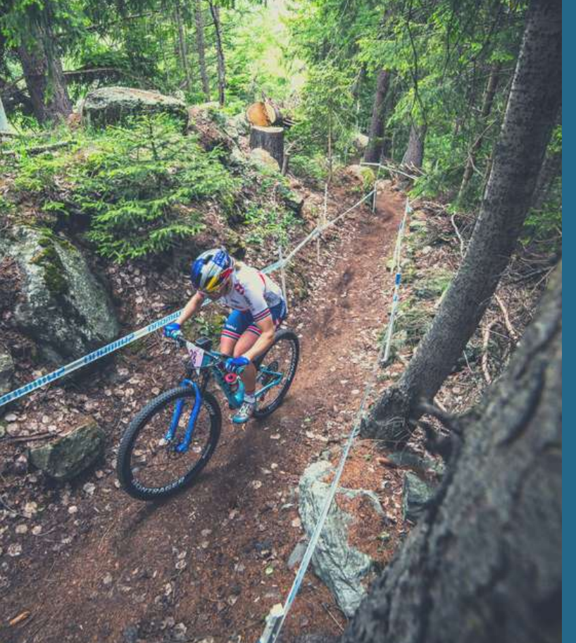
Evie Richards winner of Internazionali d'Italia Series - La Thuile '19