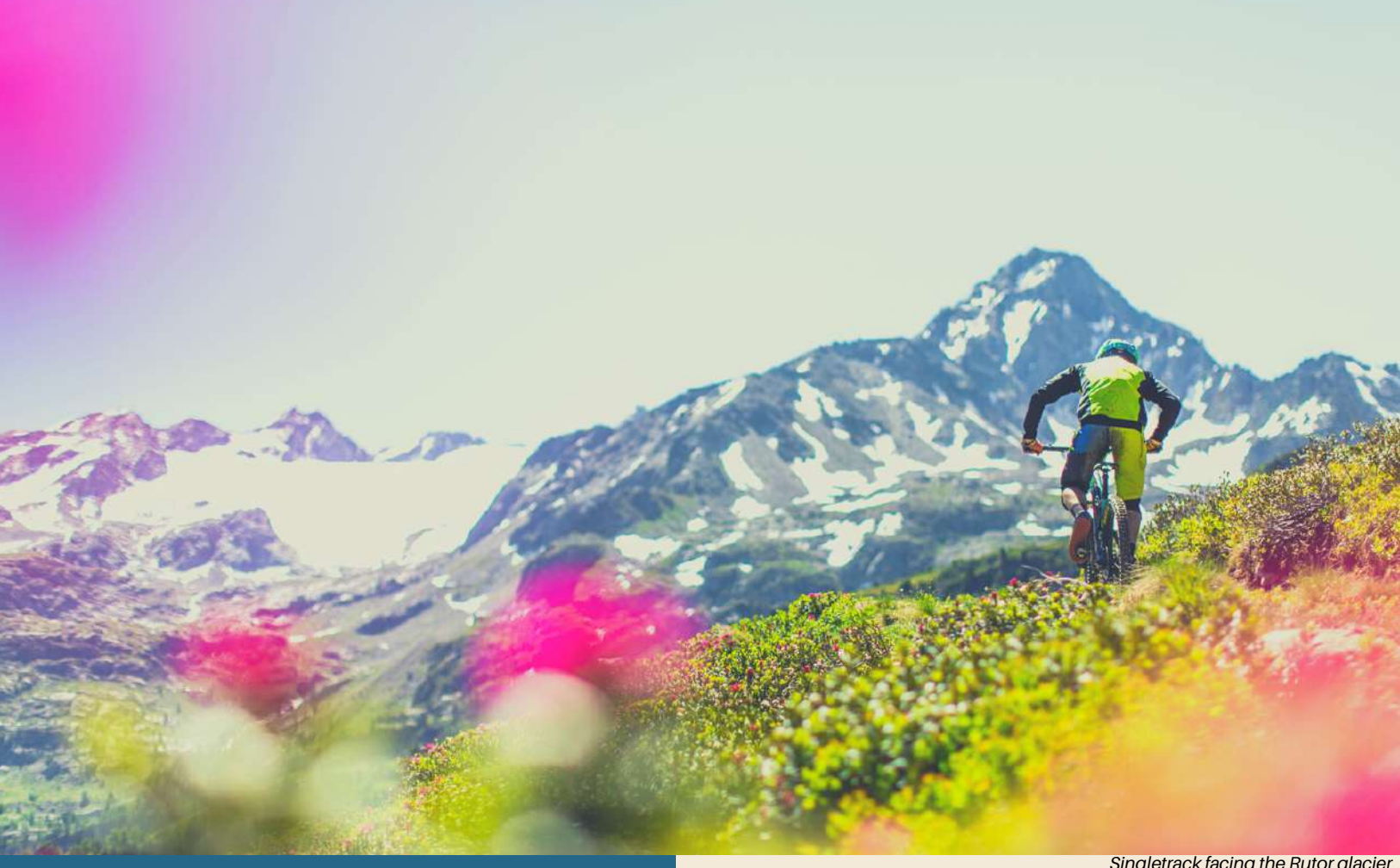
Singletrack facing the Rutor glacier